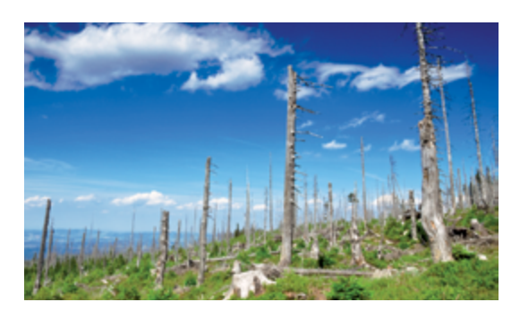
Example: Disaster Areas

period of construction. The support by regenerative energy sources such as the sun and wind save valuable fuel, meaning that, depending on the place of use, the EnergyContainer® can provide energy for months without the need for maintenance or fuel replenishment.